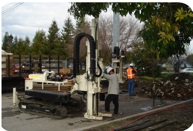
Injection of vegetable oil underground to improve conditions for bioremediation.

Bioremediation has successfully cleaned up many polluted sites and has been selected or is being used at over 100 Superfund sites across the country.